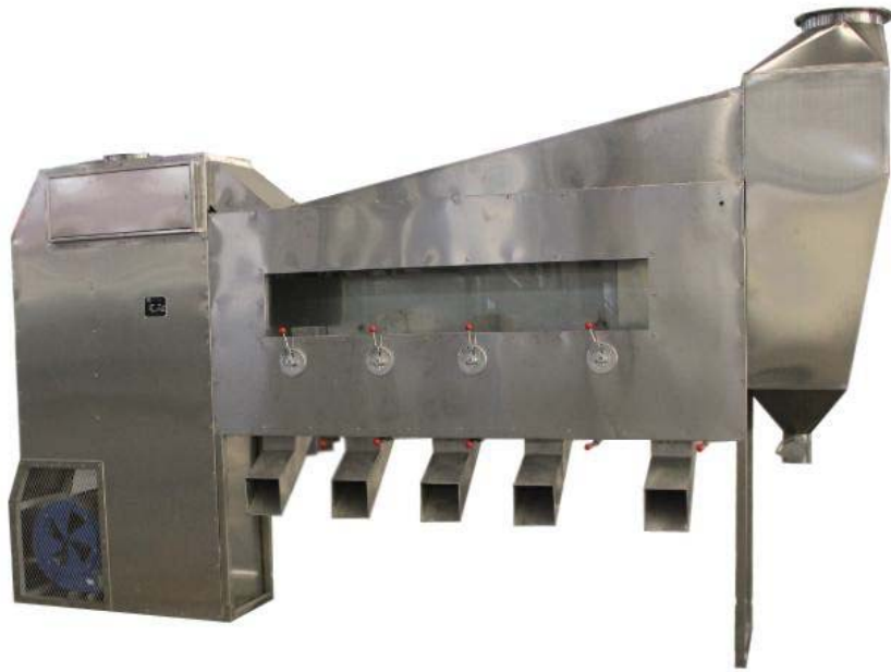
EF40 tea air sorting machine (supporting production line)