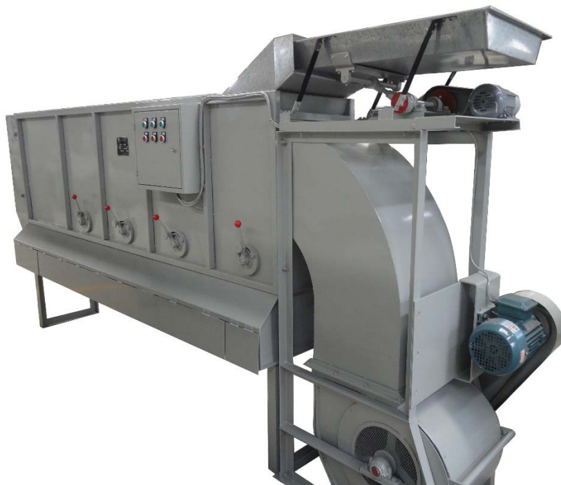
EF40 tea air sorting machine (conventional stand-alone machine)